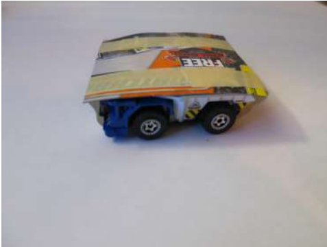
A rolling platform that simulates an isolation bearing.