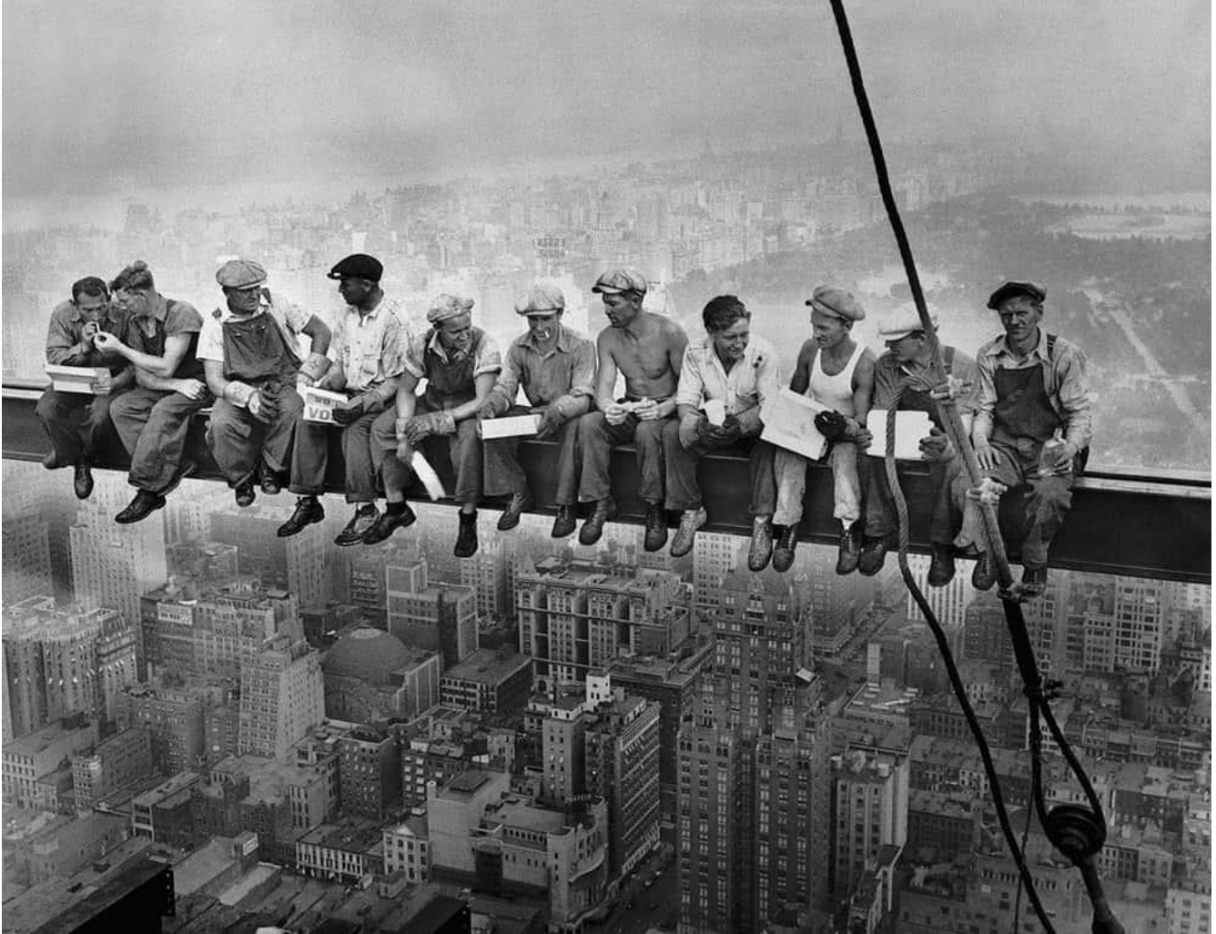
Staged for publicity to promote new building. Public Domain