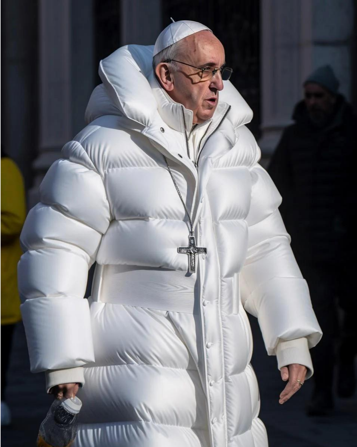
AI generated image reddit